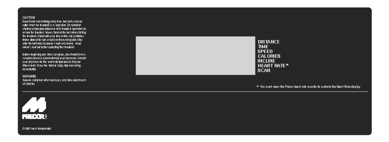
Diagram 2.1 - C942 Display