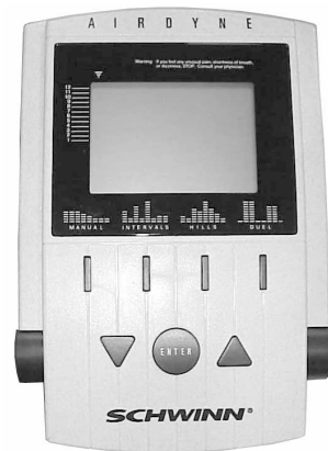
AD5 (PRO) 92900